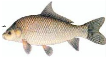
Buffalo Fish, Ictiobus cyprinellus , average size: up to 30 inches, 15 pounds.

Put you and a friend in this boat for winter steelhead.