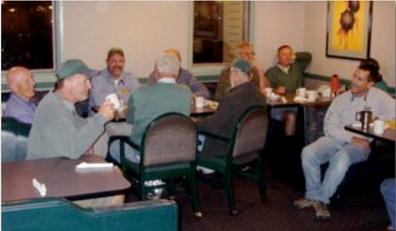
The usual suspects gather at Denny's for an early morning breakfast before heading out to fish the Stillaguamish River for Pinks and Coho. September was mostly about anadromous species for most OFF members. Read about the Stilly and an incredible trip to the Fraiser on Page 3.