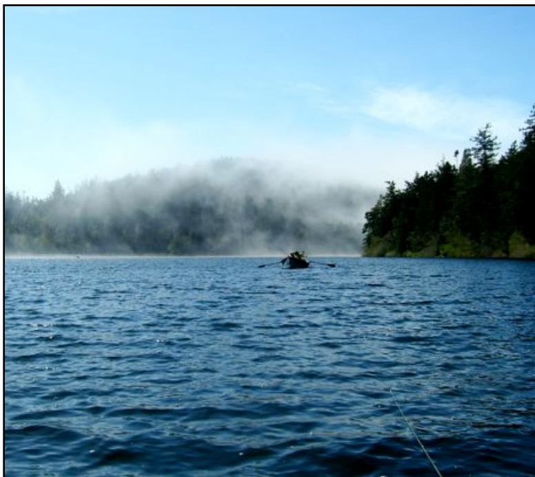
FOG LIFTS OVER PASS LAKE to reveal Jeff Salisbury in his drift boat, one of about 35 watercraft that plied the lake at our recent outing. A great day to be on the water (with a rear view mirror).