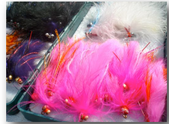
IN DIRTY WATER scale up the profile. It's often more productive than the pattern.

In the winter the fish are more likely to be down on the bottom and in summer they'll be nearer the top. For more tips go to flyfishsteelhead.com. DS